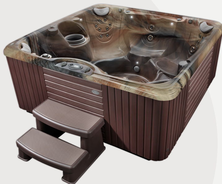
Vanto shown with Tuscan Sun shell & Espresso cabinet